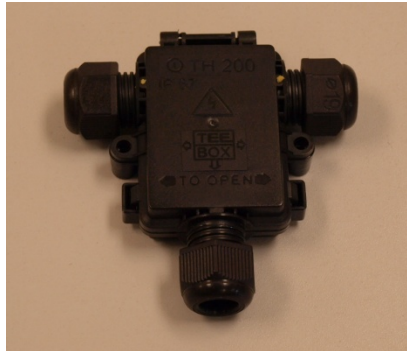
Diag. B – IL-DMB Junction Box (open view)